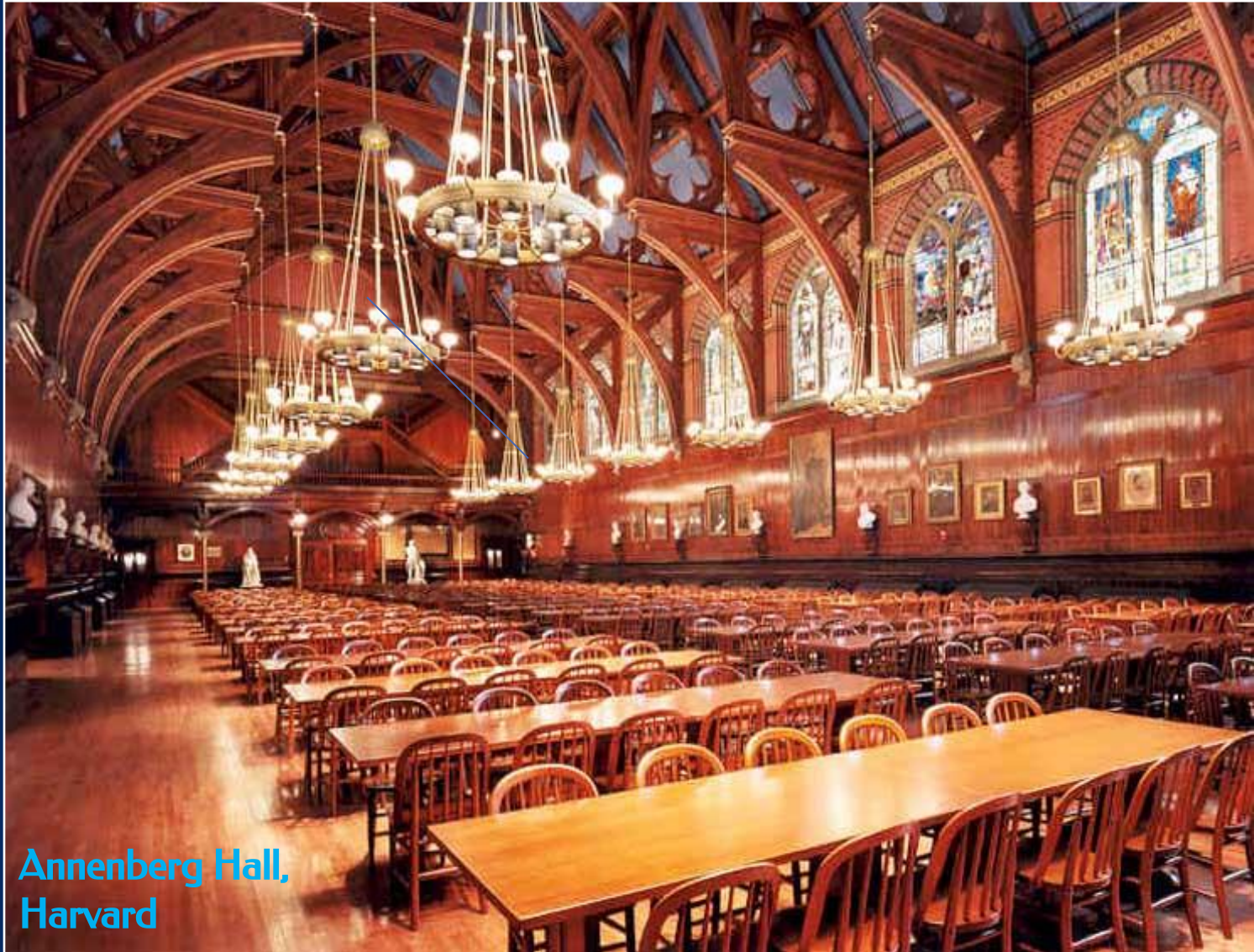
Annenberg Hall, Harvard